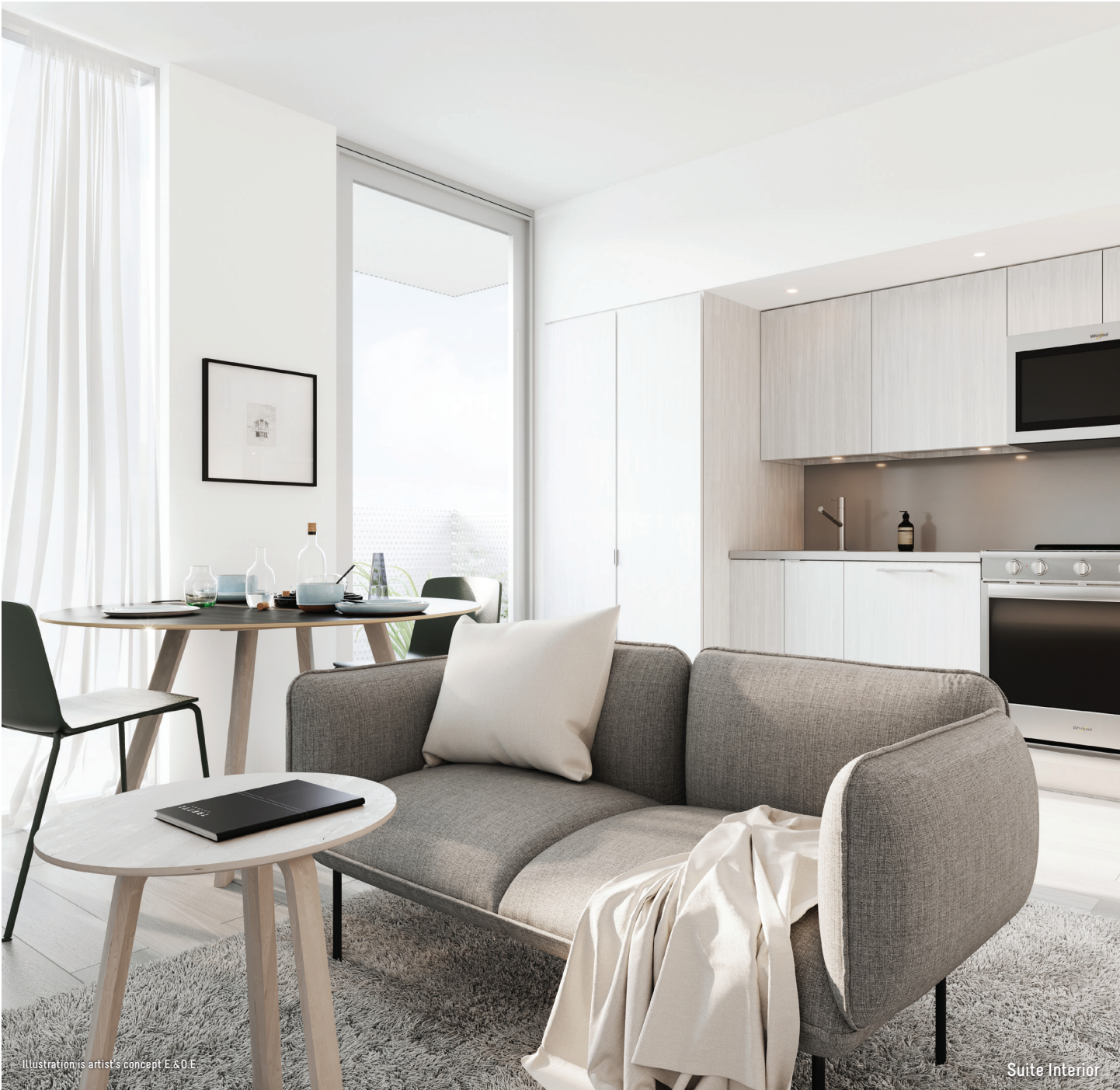
Illustration is artist's concept E.&O.E