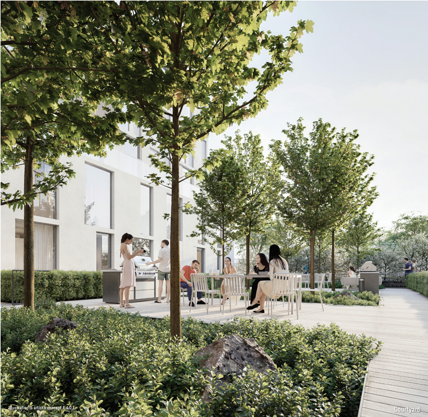
Illustration is artist's concept E.&O.E.