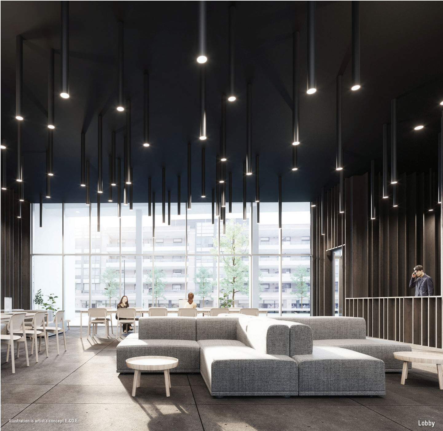
Illustration is artist's concept E.&O.E.